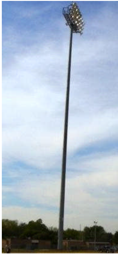
Upright Stadium Light Pole