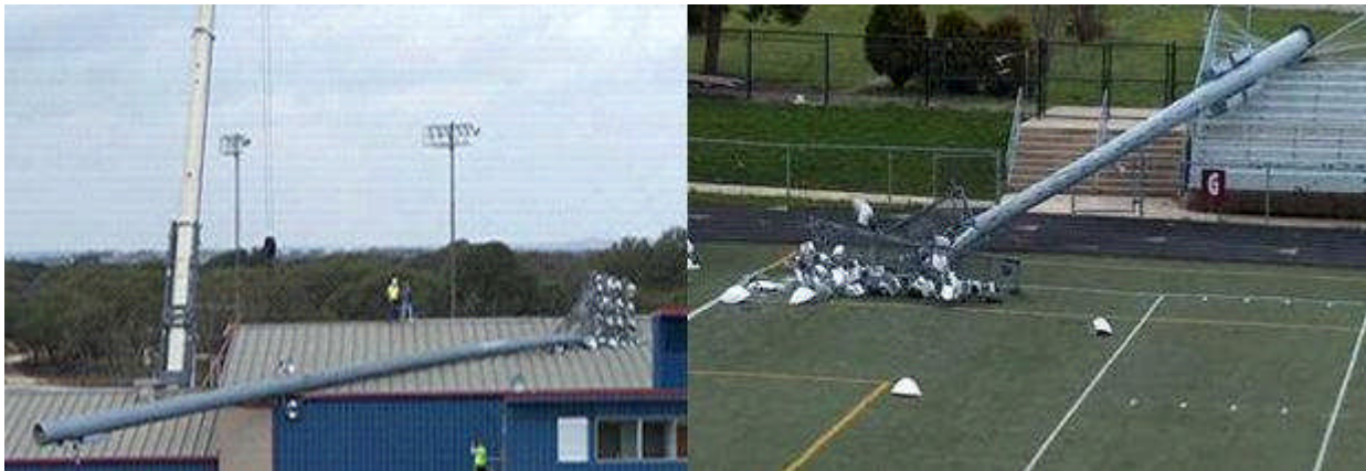
Fallen Stadium Light Poles