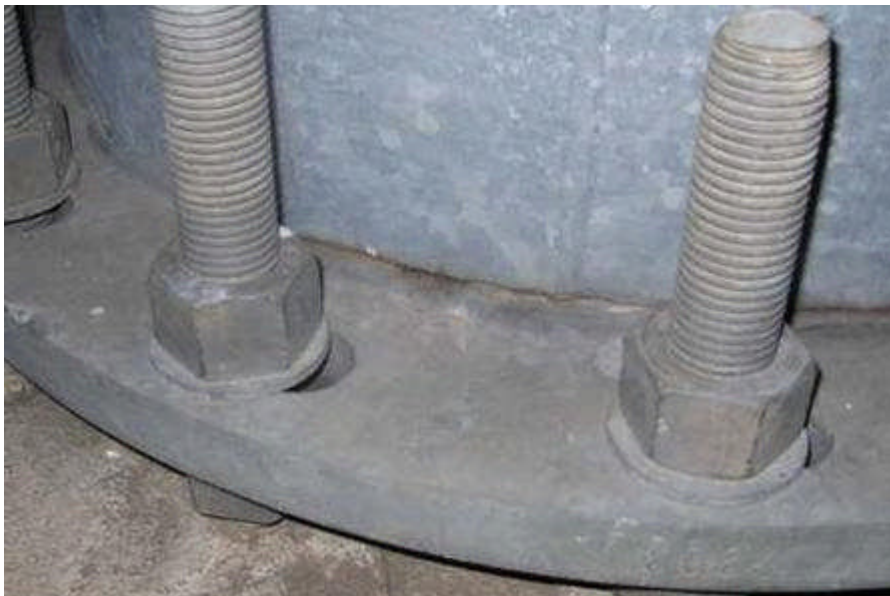
Base Plate of Stadium Light Pole